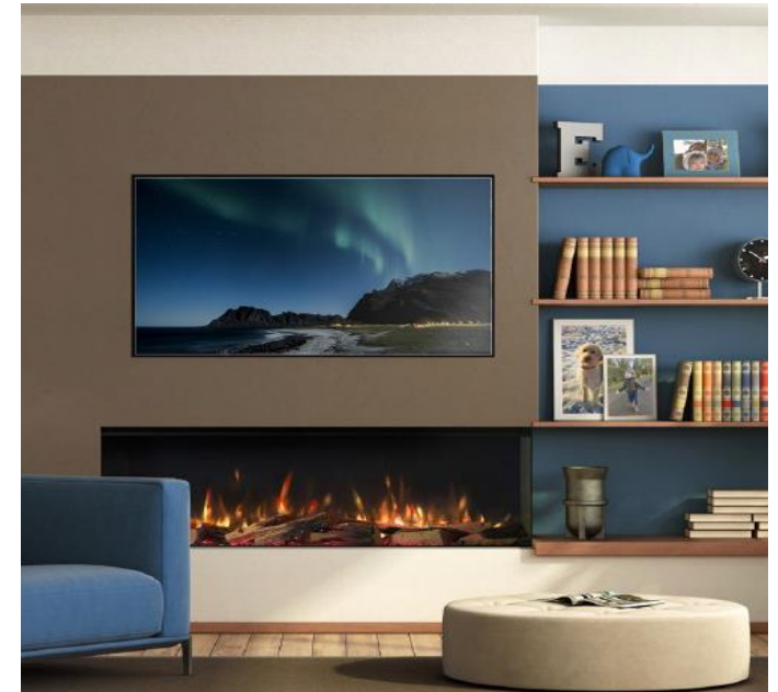
CORNER LEFT/RIGHT GLASS