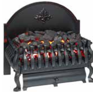
Cottesmore 224 BL