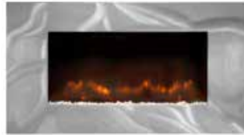
Satin trim 871