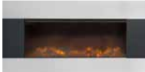
Contrast trim 896