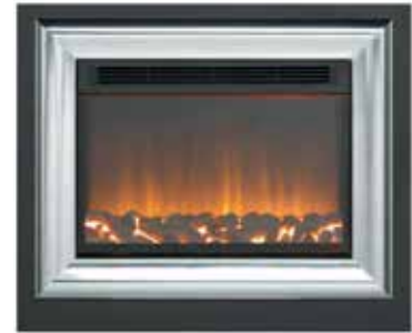
Whitwell 511-R + 811CH