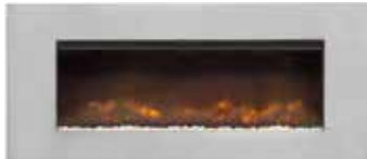
Orbital trim 892