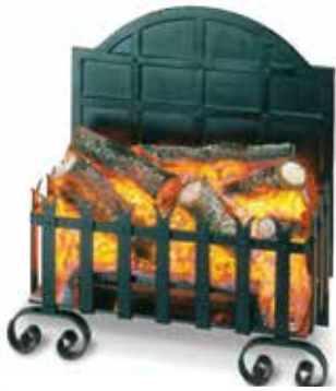
Lyddington Forge 101