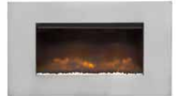
Orbital trim 872