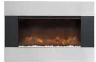
Contrast trim 876