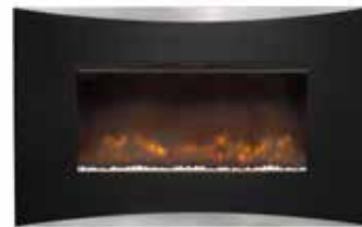
Casterton trim 873