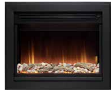
Whitwell 511-R + 811FBS