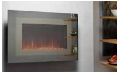
Ayston 515-S Mirror Fascia