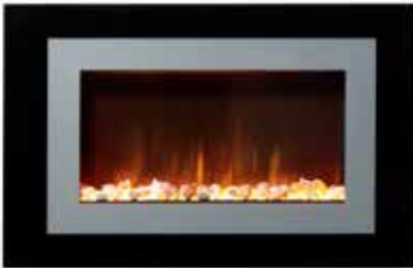
Ayston 515-S Glass Fascia