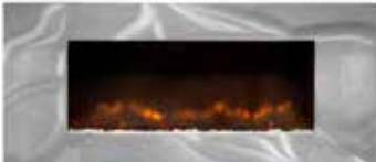
Satin trim 891