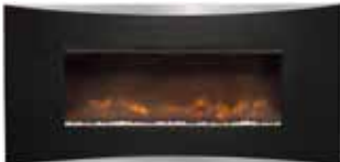
Casterton trim 893